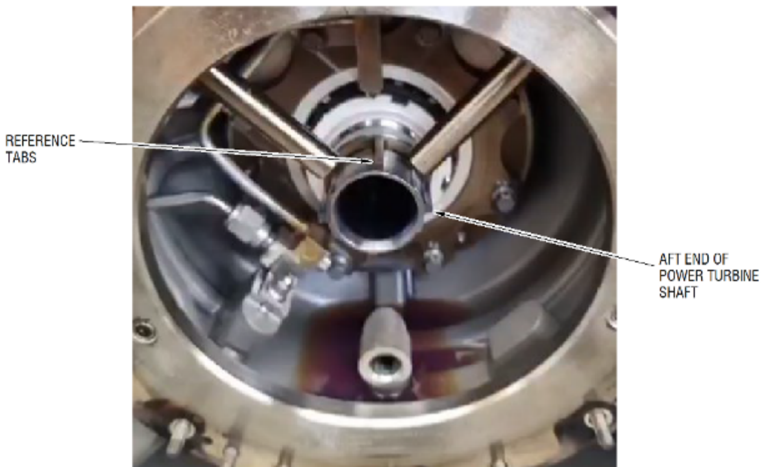
C-Sump Heat Shield and C-Sump Cover - Removal and Installation Figure 1