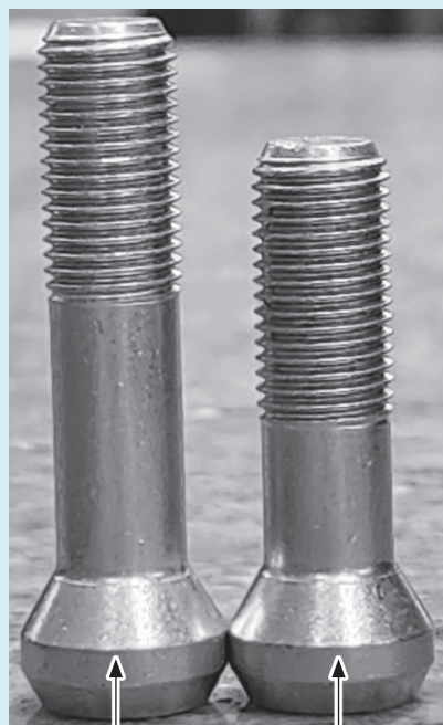
Affected Screw Not Affected Screw