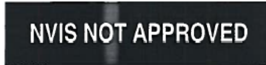
Figure 2 - "NVIS not approved" – Decal

When the "KIT NVIS CONTROLLER" is not installed or the helicopter configuration is not NVIS compatible, the following Decal (P/N 999-2000-06-221) must be installed: