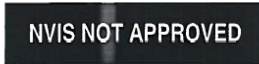
Figure 2 - "NVIS not approved" – Decal

When the "KIT NVIS CONTROLLER" is not installed or the helicopter configuration is not NVIS compatible, the following Decal (P/N 999-2000-06-221) must be installed: