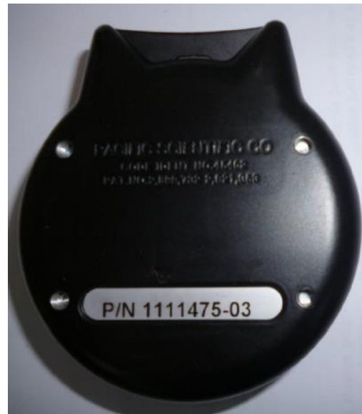
Example of a rotary buckle with unknown date of manufacturing