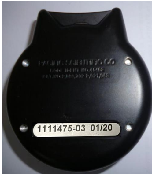
Example of a rotary buckle manufactured in January 2020

NOTE : The rotary buckle is a sub-component of the restraint system. The date of manufacturing of the rotary buckle is indicated on the buckle as shown below :