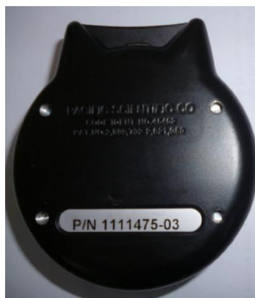
Example of a rotary buckle with unknown date of manufacturing