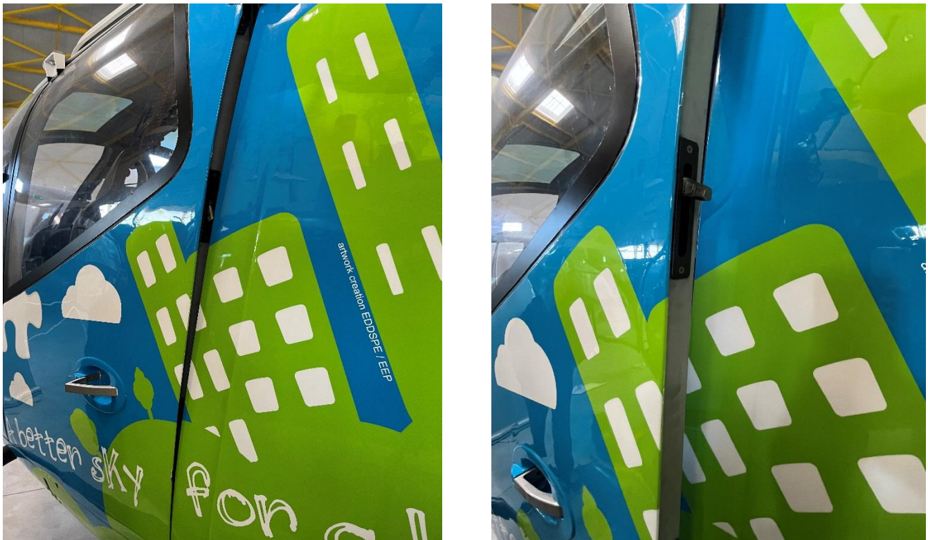
Figure 1: 2 possible configurations of the lock before loss of the door in flight - Simulation carried out by Airbus Helicopters.

Airbus Helicopters has been informed of a case of opening and loss of a sliding door in flight, probably linked to incorrect locking (2 possible configurations shown in Figure 1).