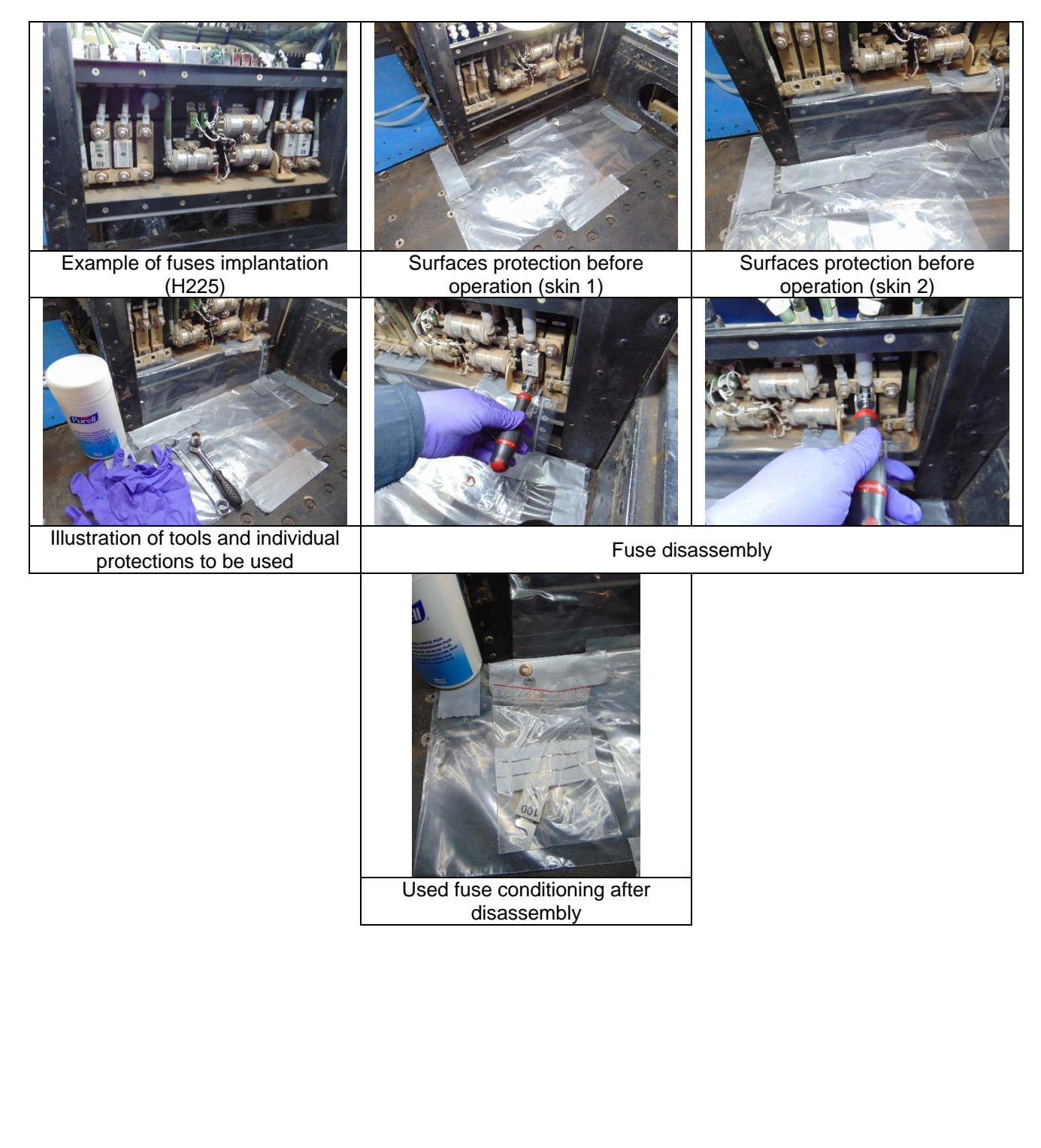
Illustration of the fuse replacement operation: