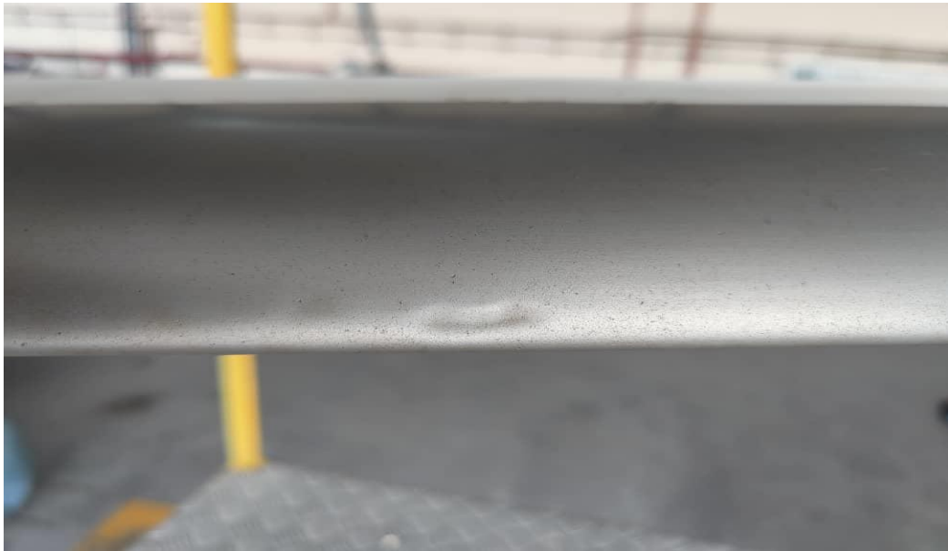
FIGURE 1 – BLADE DENTED