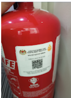
FIREX CERT 2.png 661K