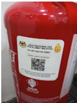
FIREX CERT.png 655K