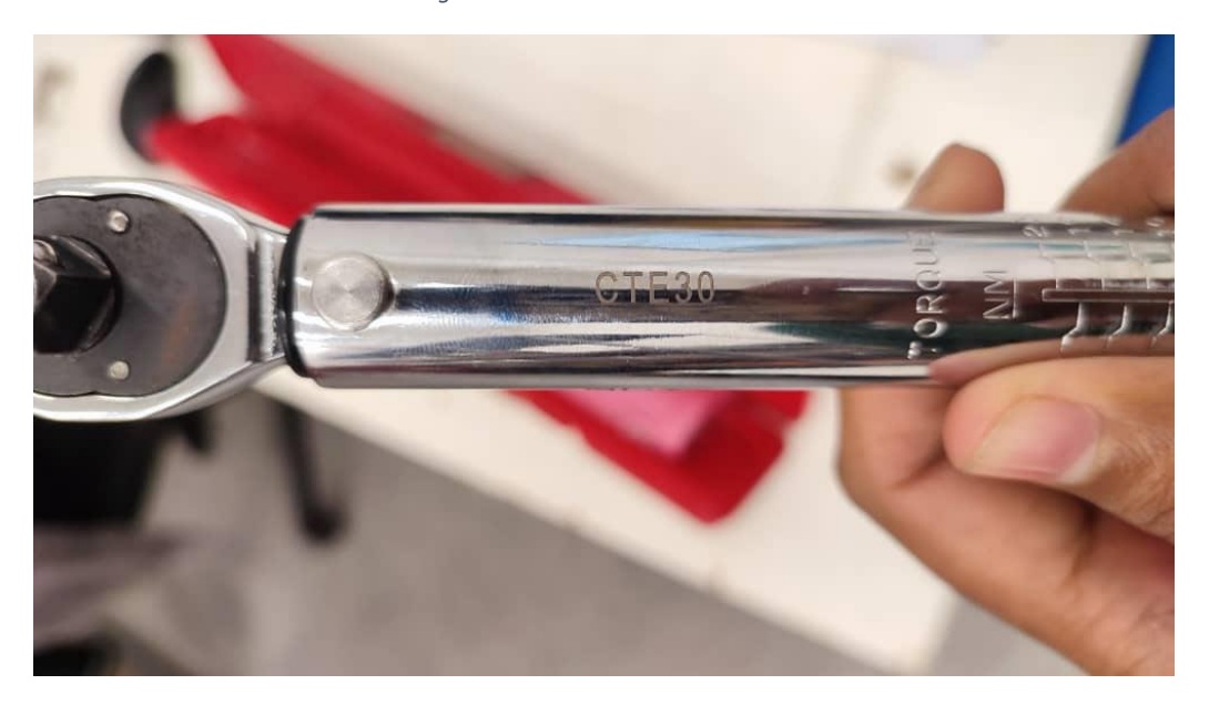
Figure 2 Engraved ID Number CTE 30

• Figure 1 and Figure 2 shows the correct Calibration sticker on CTE 30 torque wrench.