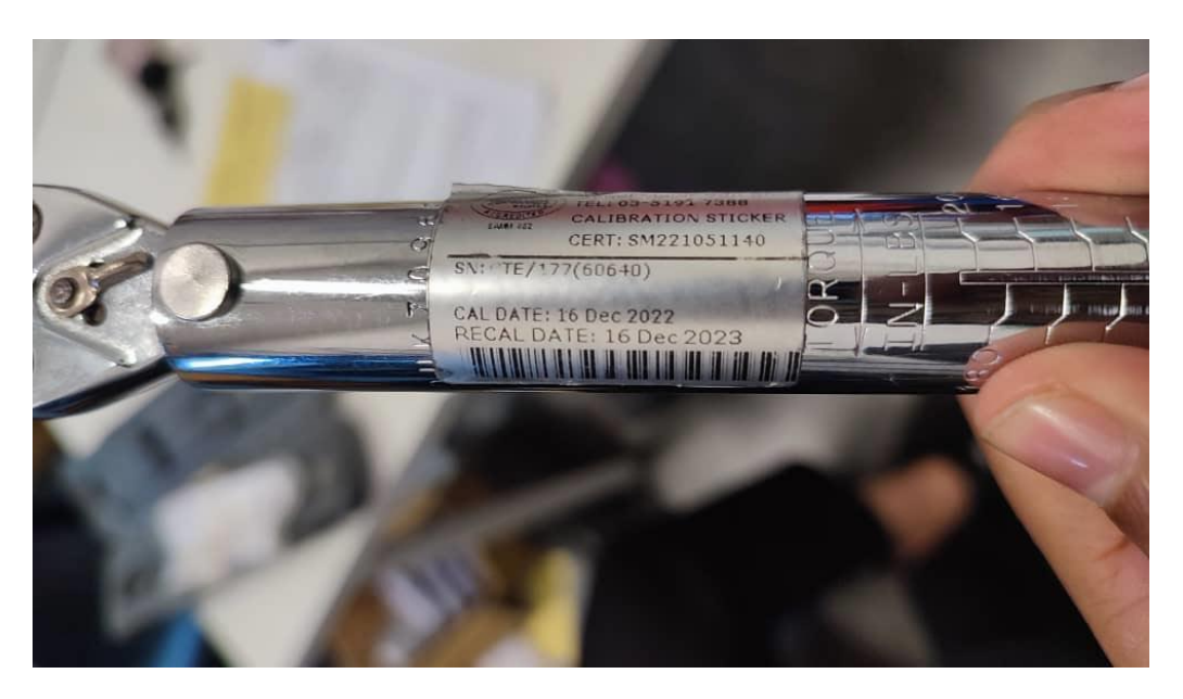
Figure 3 Calibration Sticker CTE 177