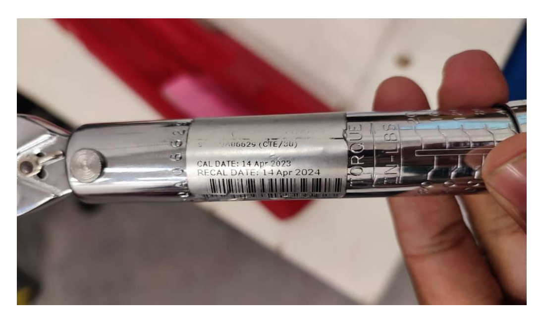
Figure 1 Calibration Sticker CTE 30