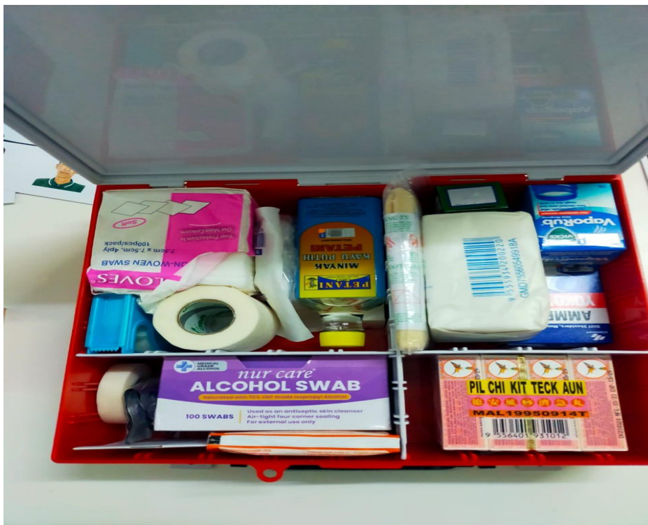
ITEMS IN THE FIRST AID KIT UNIT