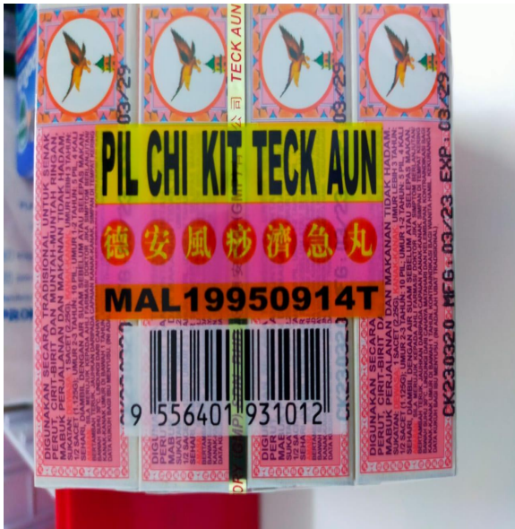
NEW PILS WITH EXPIRE DATE 03/2029