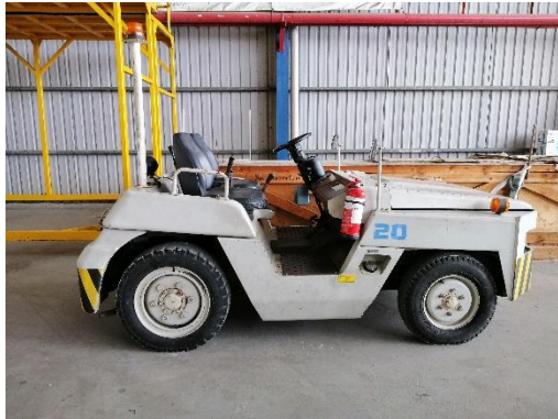
Figure 1: Tow truck