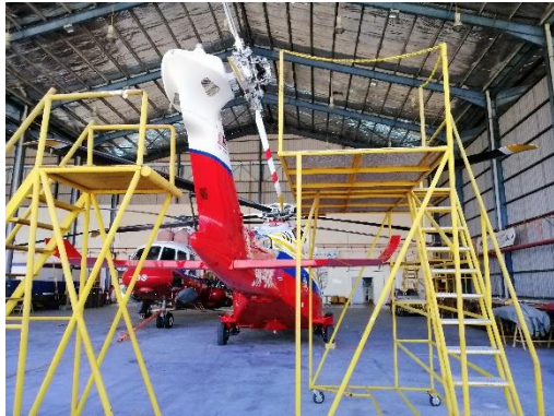
Figure 13: Working platform