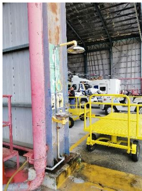
Figure 17: Emergency shower and eyewash