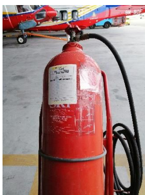
Figure 5: Fire extinguisher