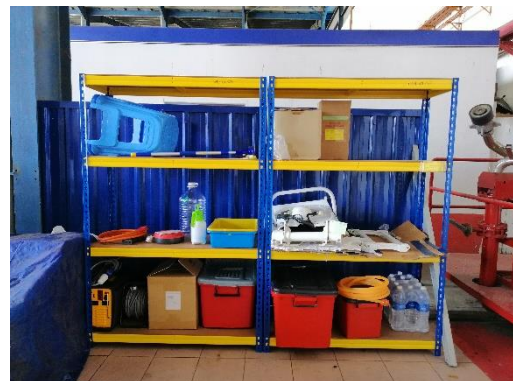
Figure 4: Maintenance Racks