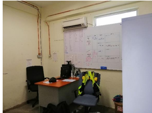
Figure 8: GAM office room