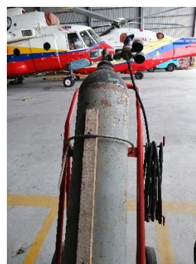
Figure 6: Nitrogen bottle