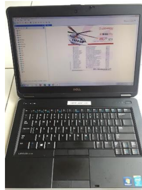
Figure 14: Laptop