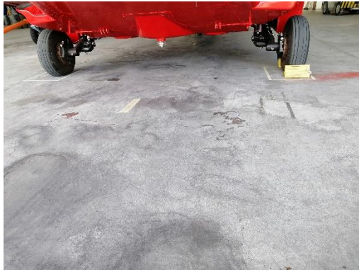
Figure 19: Parking marking at the hangar