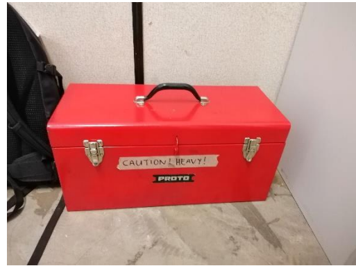
Figure 16: Standard toolbox