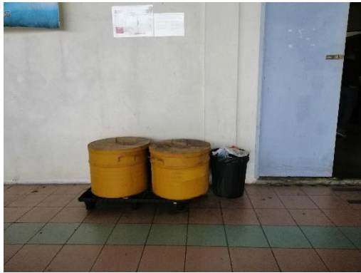
Figure 15: Waste containers