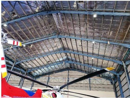
Figure 9: Hangar lighting