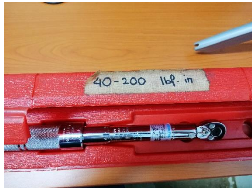
Figure 12: Torque Wrench