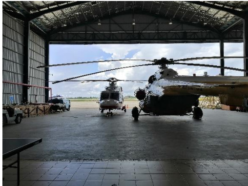
Figure 7: Hangar Area