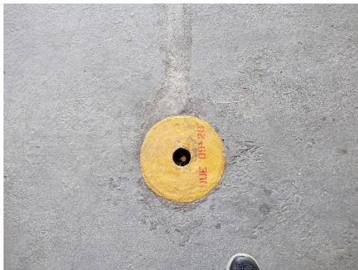
Figure 11: Grounding port