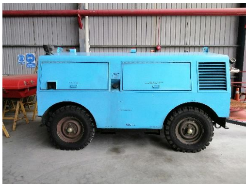
Figure 3: Ground Power unit