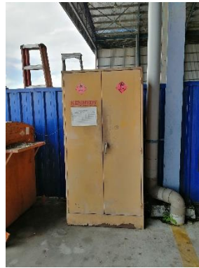
Figure 10: POL cabinet