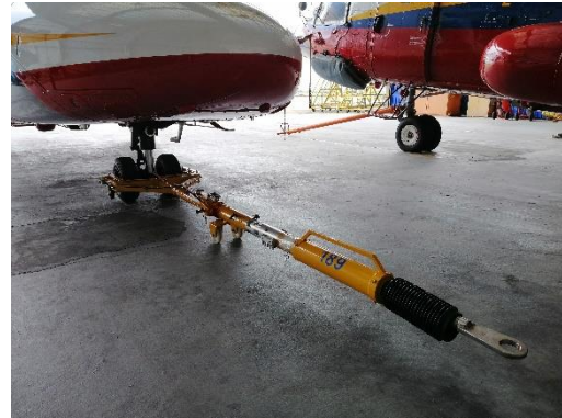
Figure 2: AW189 tow bar