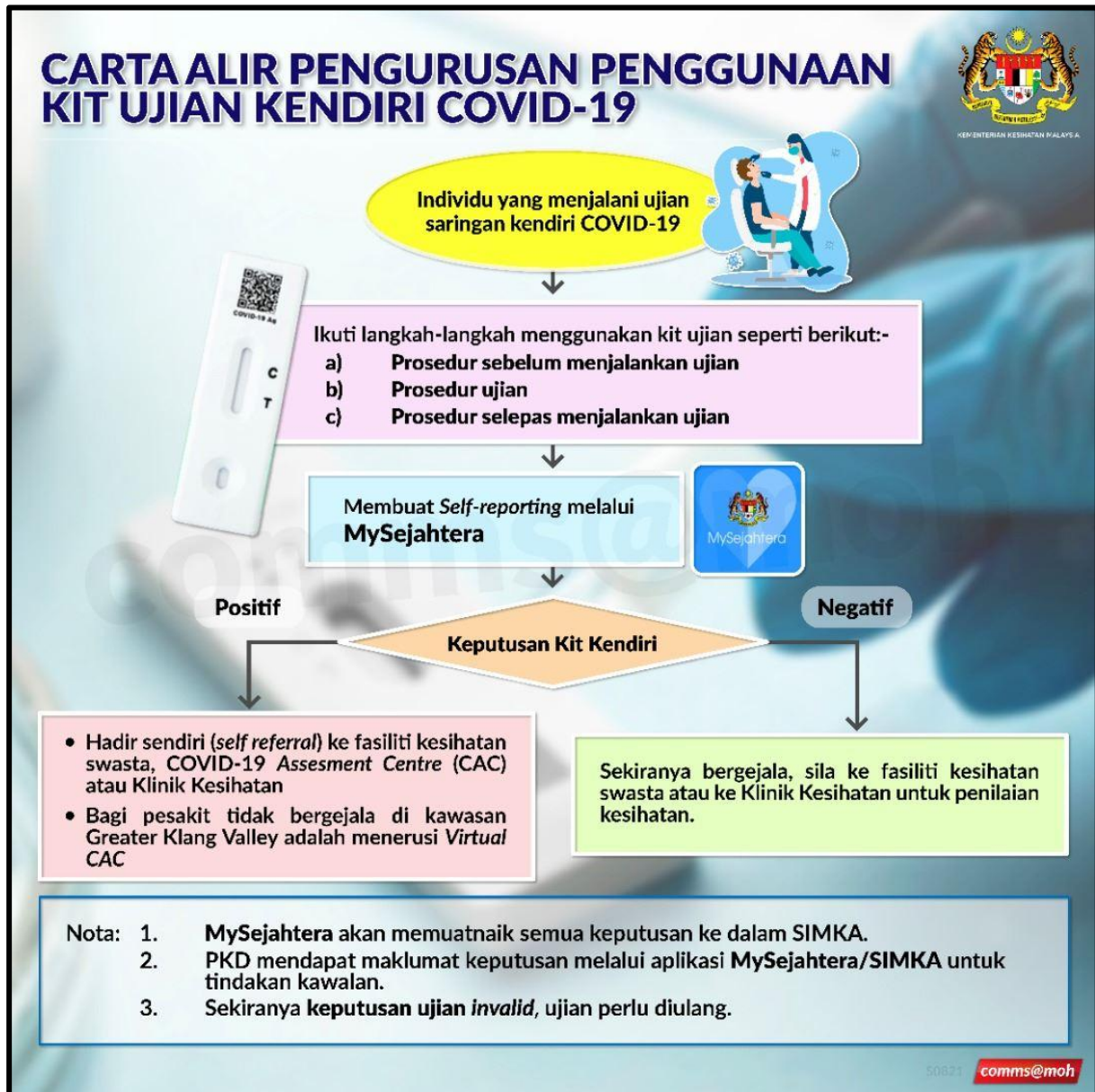
Flow Chart of Management of Covid-19 Self Test Kit

Make sure to insert your test kit waste properly into Biohazard plastic bag which provided together with set of kit.