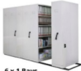
6 x 1 Bays