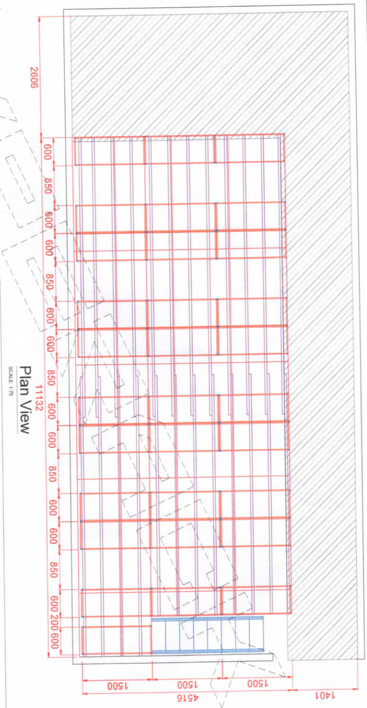
Plan View 11132 SCALE: 1/75