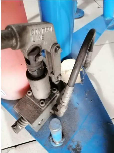
MODEL: 02-7856-0100; S/N: 9540090101.