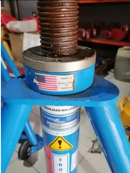
MODEL: 02-7856-0100; S/N: 3150081203.