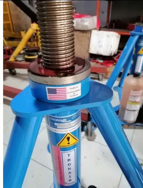
MODEL: 02-7856-0100; S/N: 9540090103.